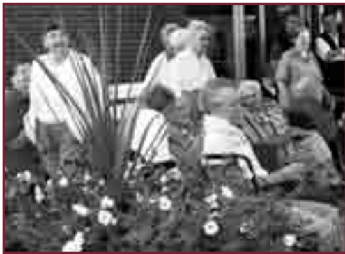
▲ Waiting for the new bus to arrive.

Happily we were able to ensure that our old bus will be re-cycled. It has been sold to another senior's facility in the city where it will be put to very good use. For the budget minded, at the time of signing the contract to purchase our new bus the Canadian dollar was at a long time high. That, coupled with the sale of the old vehicle, has meant that the new bus has been purchased for virtually the same price as was paid for the original vehicle in 1997. Well Done!! ☺