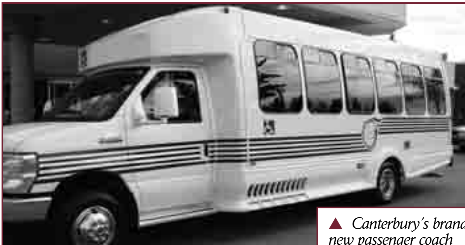
▲ Canterbury's brand new passenger coach