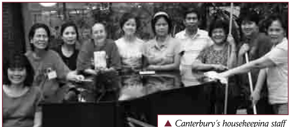
▲ Canterbury's housekeeping staff

But Housekeeping is about much more than general appearance. Housekeeping is a partner with every other department in our facilities. They work hand in hand