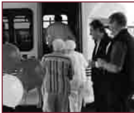
▲ Residents boarding the bus