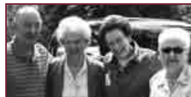
▲ 50's Days: Remember when...