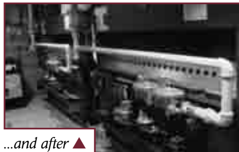
...and after ▲